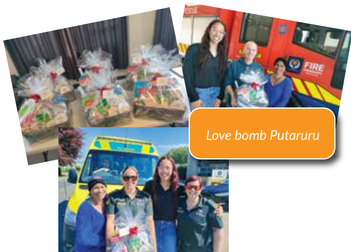
Love bomb Putaruru

continue to be popular with the locals. The beginner's class averages thirty students and the advanced class thirty-eight. The beginners accelerate their learning so they can join the advanced class by the end of each year. Allowing a fresh batch of students to begin the year afresh.