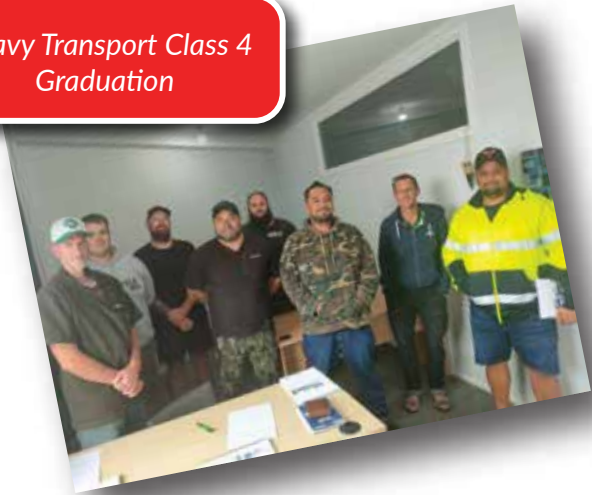
Heavy Transport Class 4 Graduation

She has many goals for the future and expressed that one was to be a truck driver and drive tanker trucks for Fonterra. I smiled and with a raised eyebrow informed her that I could help with that dream and the next program was in May. She sat in silence completely dumbfounded by my offer. I told her we could assist her up to the Class 4 and that she had what it takes to achieve all this by mid-November. With a grin on her face, she said 'thank you for having so much faith in me. I'm getting nervous and excited all at once and it's not until May.' She walked out my office door like she had just won the lottery. My guess is that this young woman is about to embark on an adventure of a lifetime.