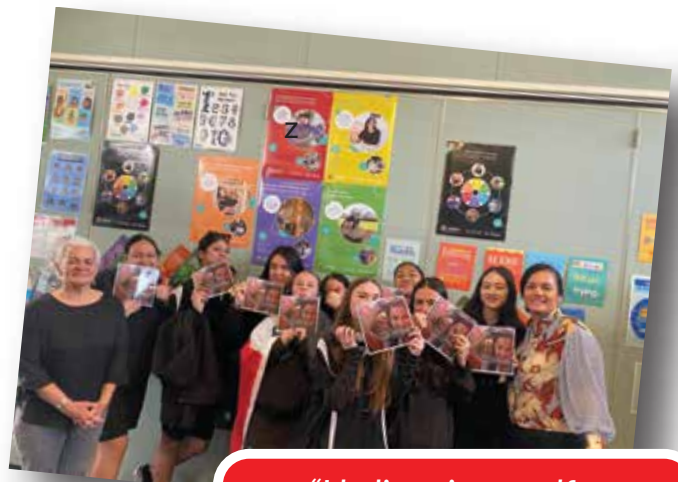
"I believe in myself now. I have a positive future" -ShineGIRL participant

This week I had a call from one of our men I asked him for permission to use his story for a project I am working on and with a lot of passion in his voice said, "You can use what you like, I owe Transform my life"! He has made so many positive changes and continues to do so that he has become another one of our success stories of a life of crime to living the dream. It was immensely heart-warming to hear him give so much credit to Transform for his personal transformation.